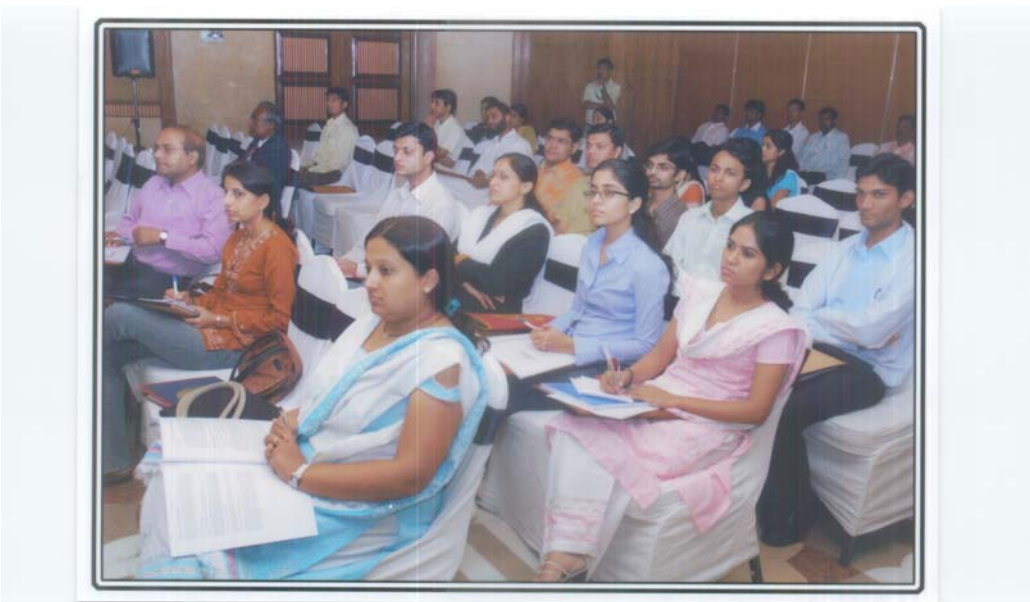
Participants at Ahmadabad