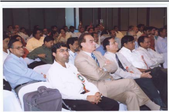
Participants at Kolkata